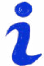
to know more